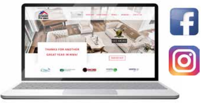
nwaparadeofhomes.com | @nwaparadeofhomes

Interactive Parade Website & Social Media