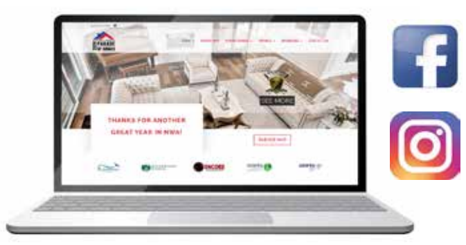
nwaparadeofhomes.com | @nwaparadeofhomes